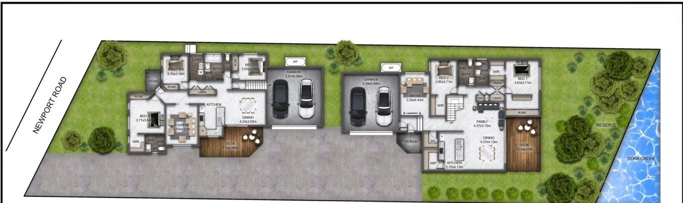
DWELLING 1 FLOOR PLAN