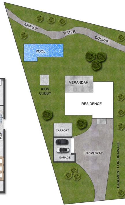
MIRRABOOKA ROAD SITE PLAN

This floor plan including furniture, fixture measurements and dimensions are approximate and for illustrative purposes only. BoxBrownie.com gives no guarantee, warranty or representation as to the accuracy and layout. All enquiries must be directed to the agent, vendor or party representing this floor plan.