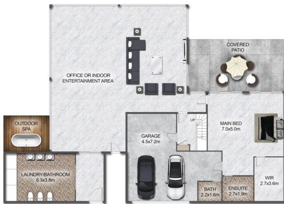
LOWER LEVEL FLOOR PLAN