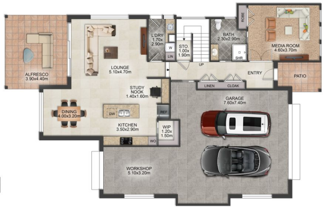
MAIN HOUSE LOWER LEVEL FLOOR PLAN