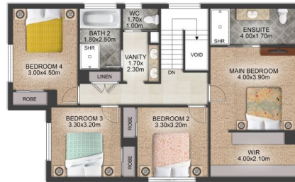
MAIN HOUSE UPPER LEVEL FLOOR PLAN

This floor plan including furniture, fixture measurements and dimensions are approximate and for illustrative purposes only. BoxBrownie.com gives no guarantee, warranty or representation as to the accuracy and layout. All enquiries must be directed to the agent, vendor or party representing this floor plan.